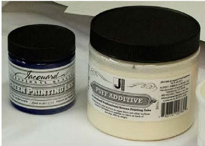
Jacquard Screen Ink and Puff Additive