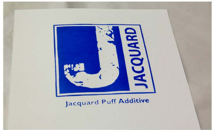
4. Allow time for partial drying