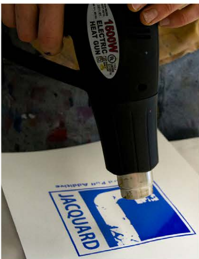
5. Heat print to 275°F with heat gun or oven