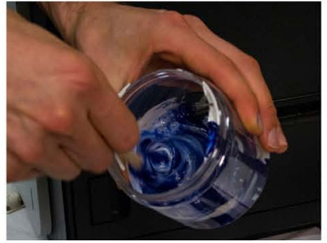
2. Mix thoroughly