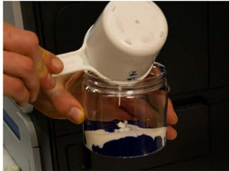
1. Add Puff Additive to Jacquard Ink