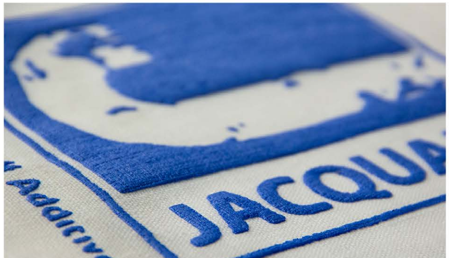
6. Check out your puffed print!!!