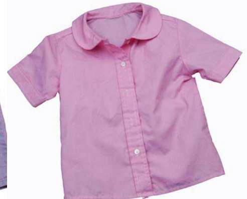
After: The same shirt and jeans, following a treatment with pink iDye