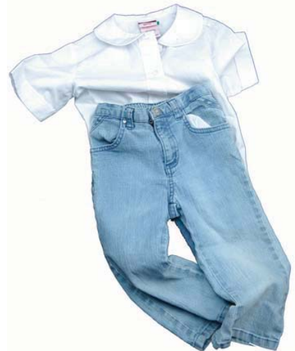
Before: Toddler’s shirt and jeans

Follow the same steps to revitalize dingy whites, remove unwanted color stains, or lighten an existing color with iDye Color Remover, also $3.59.