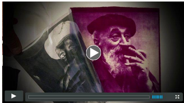
SolarFast: An Instructional Video

This exciting new line of dyes opens a whole new world of possibilities, in both DIY fashion and fine arts. Textile and paper artists alike can now print continuous tone photographs in any color, quickly and easily. No darkroom required! Printing on fabric has never been easier: no heat, steam or chemical setting needed, and it leaves fabric completely soft to the touch. On paper, SolarFast has zero relief and offers ultimate detail. SolarFast is washable, lightfast and archival.