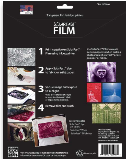
SolarFast™ Film, front and back