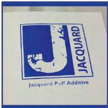
4. Allow time for partial drying