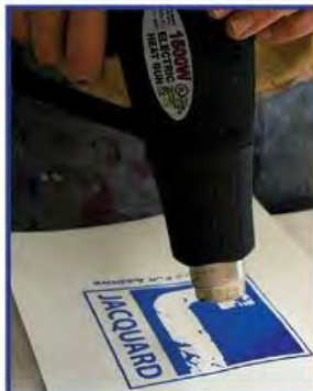
5. Heat print to 275°F with heat gun or oven