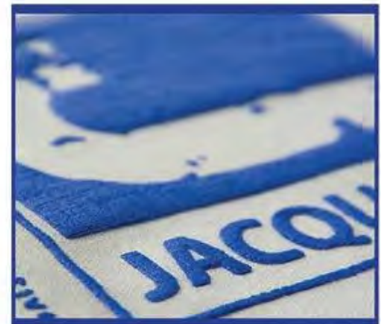
Check out your puffed print!