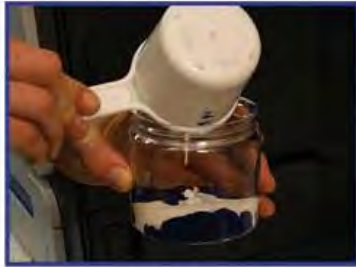
1. Add Puff Additive to Jacquard Ink