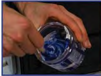
2. Mix thoroughly