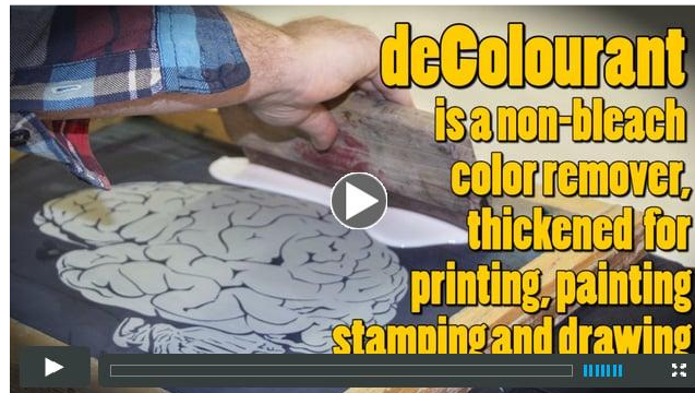
VIDEO - deColourant™ from Jacquard Products

deColourant is a ready-to-use printing paste for removing areas of color from dyed fabrics such as cotton, linen, silk and wool. Unlike bleach, deColourant removes color without jeopardizing the integrity of the fiber. Great for screen printing, stamping, stenciling, brushing and drawing. Once applied, activate with heat from an iron, heat gun or heat press. The color only disappears where heat is applied. After color removal, wash fabric to return to natural softness.