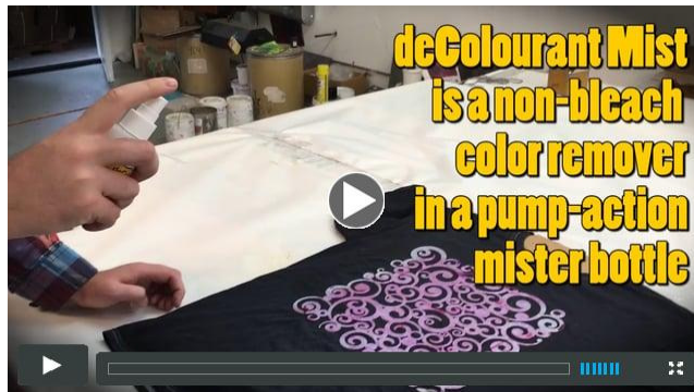
VIDEO - deColourant Mist™ from Jacquard Products

object. Once applied, activate with heat from an iron, heat gun or heat press. The color only disappears where heat is applied. After color removal, wash fabric to return to natural softness.