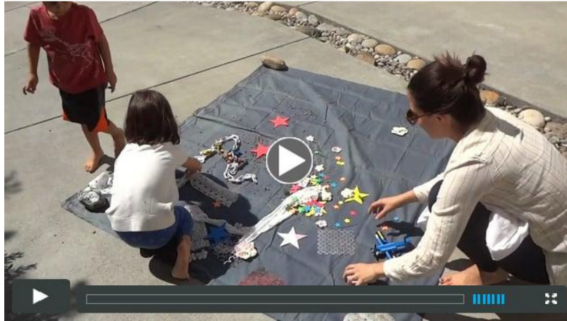
Lessons from a 6 yr old: Cyanotype Mural Fabric

Cyanotype is a photographic printmaking process that is so simple, even children can enjoy professional-quality results. We believe it is a fantastic way to introduce children to the magic of science, photography, nature and art, and the panel of educators, mothers and professionals at Creative Child Magazine wholeheartedly agree!